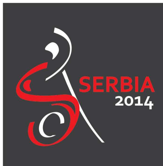
2014 IPC WDS SERBIAN OPEN CHAMPIONSHIP